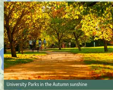
University Parks in the Autumn sunshine