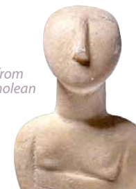
Cycladic figurine from the Ashmolean Museum

Opening times are subject to University functions, bank holidays, conferences, etc. Please check with the place you wish to visit. Charges and opening hours are subject to change.