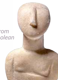
Cycladic figurine from the Ashmolean Museum

Opening times are subject to University functions, bank holidays, conferences, etc. Please check with the place you wish to visit. Charges and opening hours are subject to change.