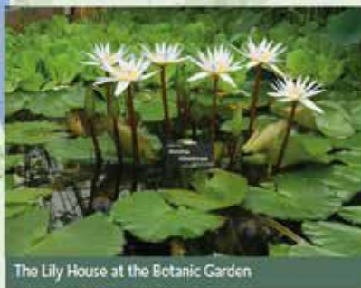
The Lily House at the Botanic Garden