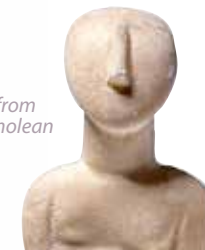
Cycladic figurine from the Ashmolean Museum

Opening times are subject to University functions, bank holidays, conferences, etc. Please check with the place you wish to visit. Charges and opening hours are subject to change.