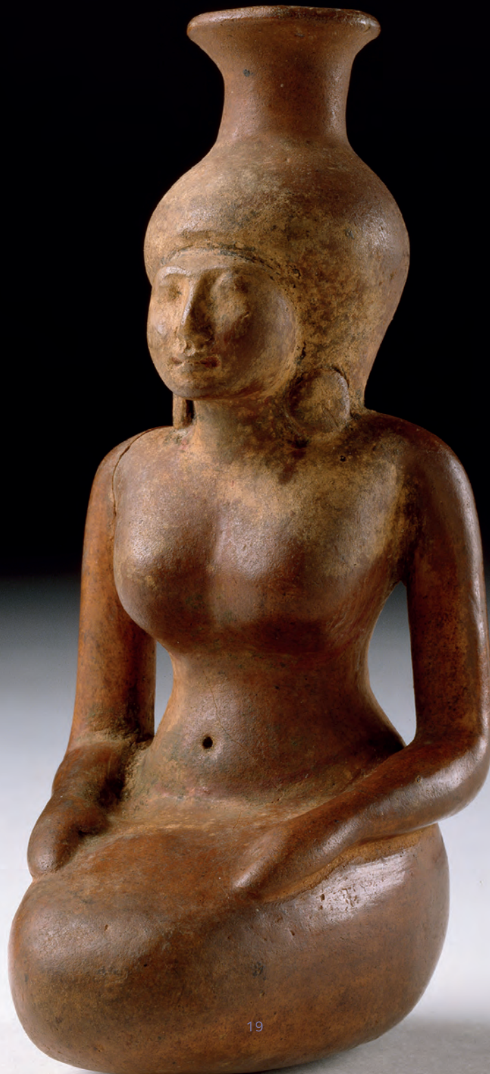
Pottery vase in the shape of a woman, from the XVIIIth Dynasty (c.1540–1292) in Egypt, found in Abydos