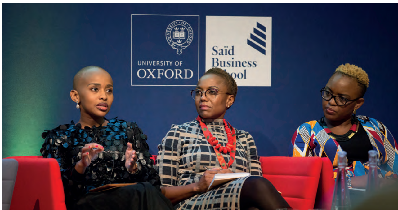
Guest speakers at the Oxford Africa Business Forum 2018