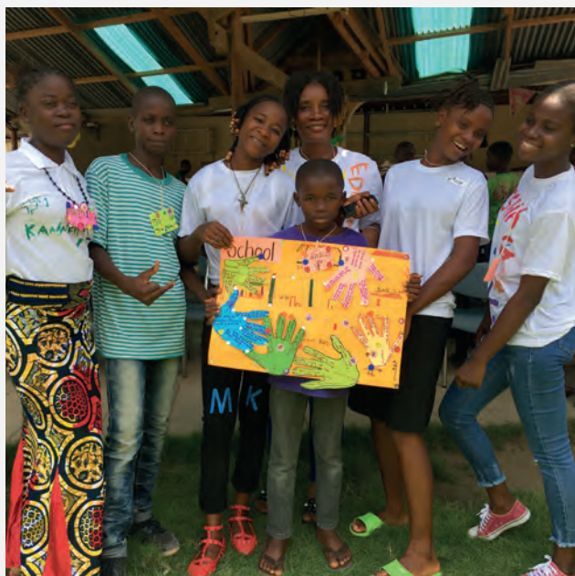
Teen Advisory Group (Sierra Leone)