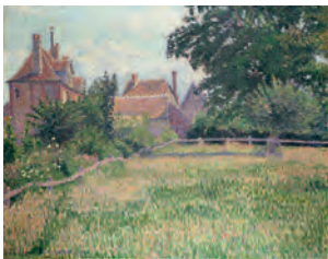
Paintings by Impressionists including Pissarro, Manet and Renoir.