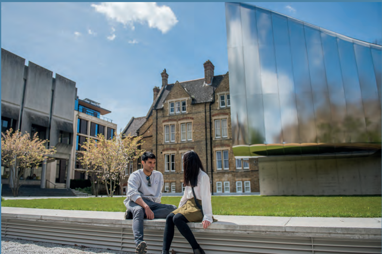
Below: St Antony's College where the Europaeum Scholars Programme is based

In 2018 the Europaeum launched its multi-disciplinary, multi-university, and multi-locational Scholars Programme, with the aim of producing a new generation of leaders, thinkers, and researchers who have the capacity and desire to shape the future of Europe.