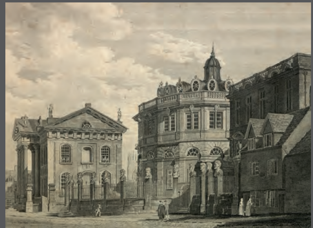
Engraving of Broad Street, Oxford, by James Basire, from a drawing by Edward Dayes, c.1800

Oxford played a leading role in training British civil servants for service abroad from the middle of the nineteenth century. In the 1960s these courses opened up to aspiring diplomatic leaders from around the world, transforming into the Diplomatic Studies Programme, also known as the Foreign Service Programme, which still exists today. The Programme now has more than 1,200 alumni and has contributed staff to more than 140 countries' diplomatic services.