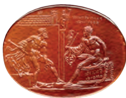
The Felix Gem: an engraved sealstone from Rome in the 1st century AD, depicting an episode of the Trojan War.

Established in 1683, Oxford's Ashmolean Museum is the oldest public museum in the world. It holds over a million objects from across the globe that date from 500,000 BC right up to the present. The collections chart the development of European culture from the triumphs of classical Greece and Rome, through the Renaissance, to masterpieces of modern art. Highlights include: