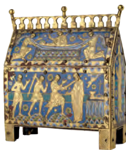
A reliquary casket of Thomas Becket from Limoges, France (c. 1200) showing the saint's murder on 29 December 1170.