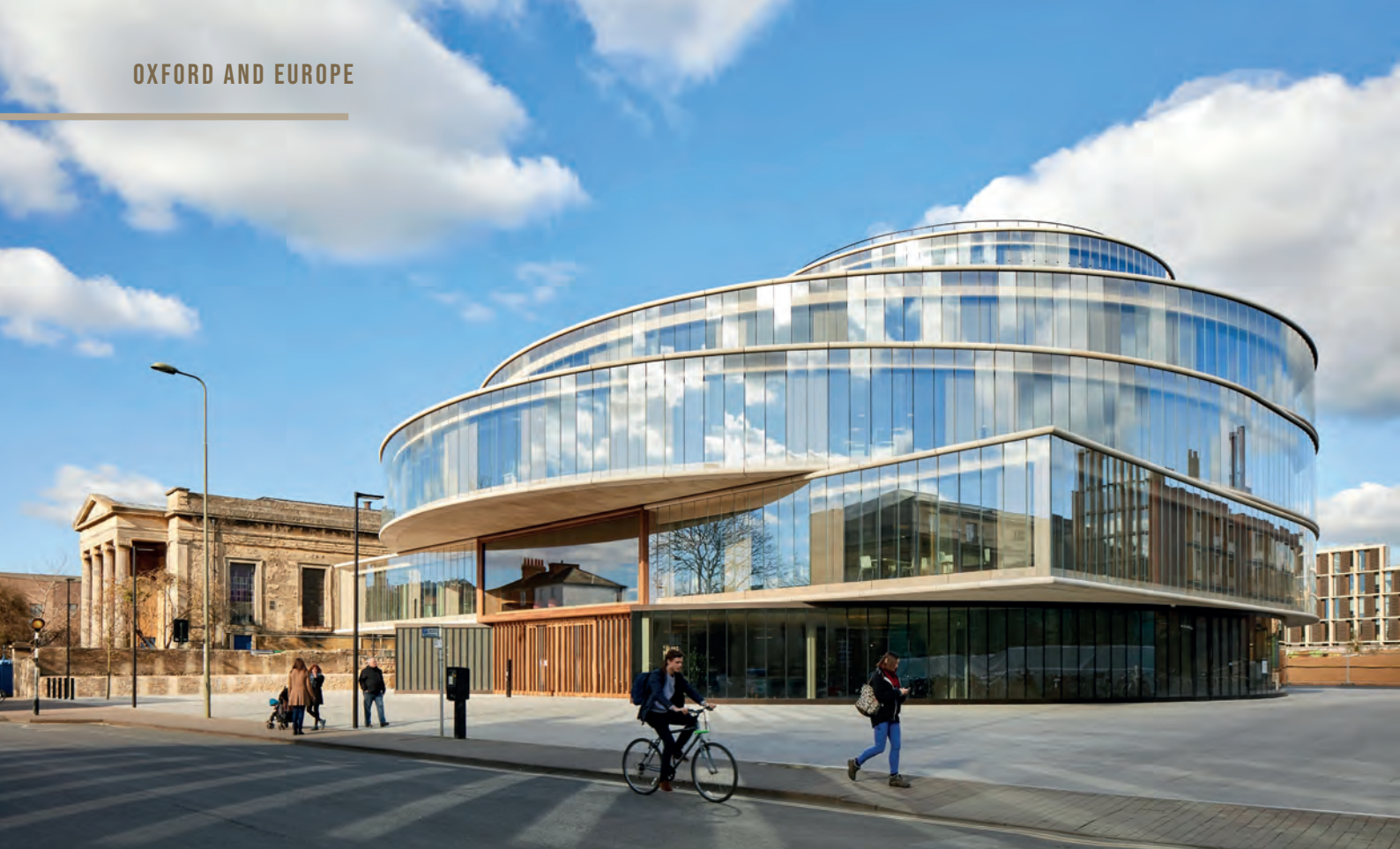
Above: The Blavatnik School of Government