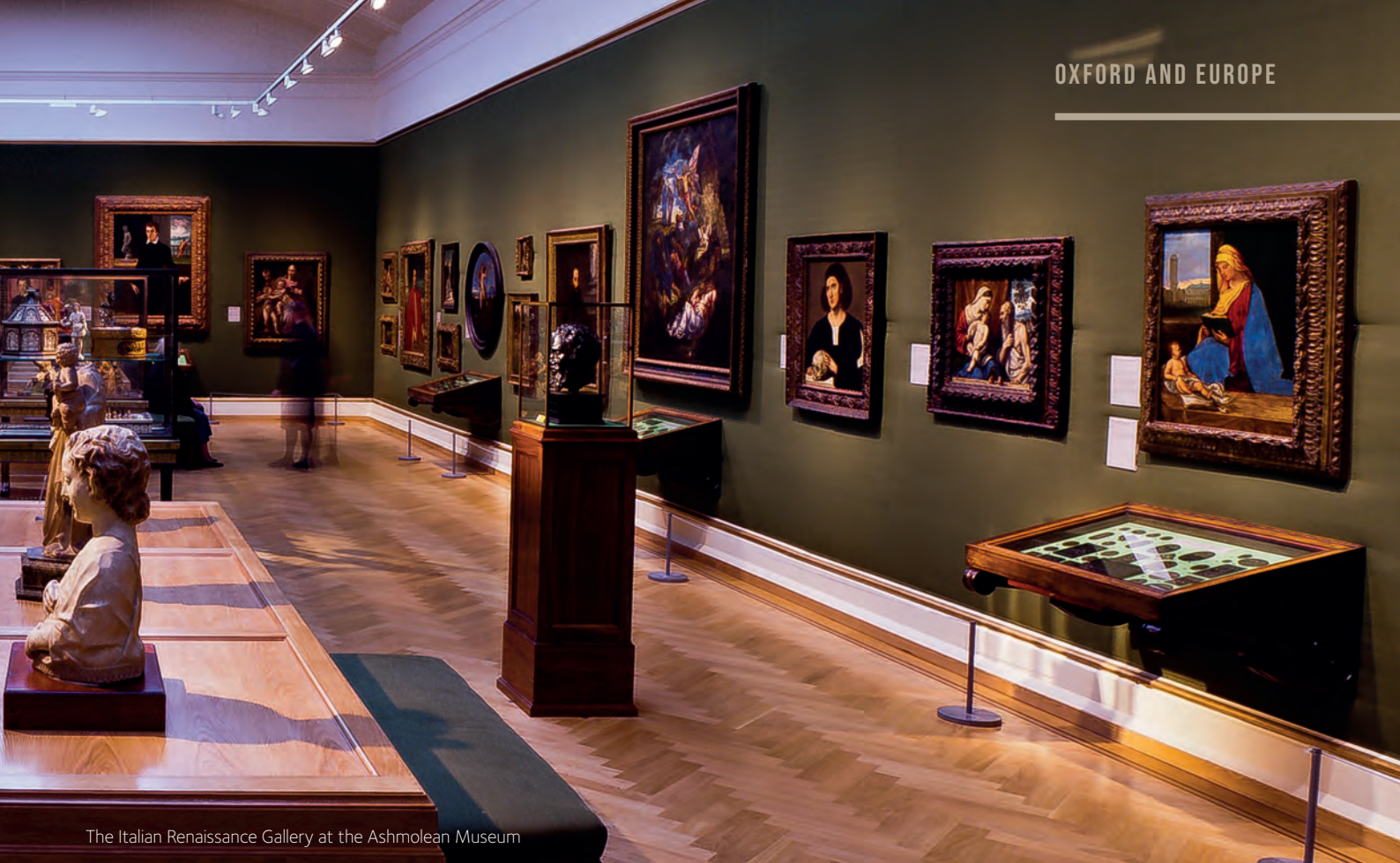
The Italian Renaissance Gallery at the Ashmolean Museum