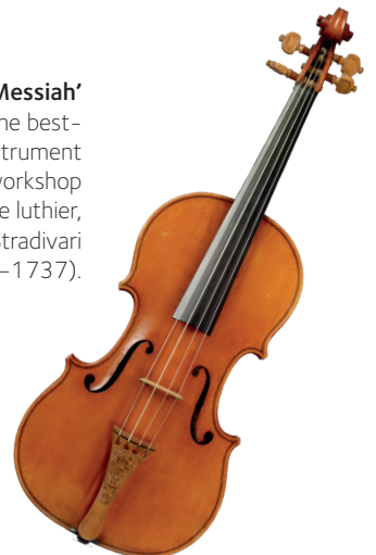
The 'Messiah' violin: the best-preserved instrument from the workshop of Cremonese luthier, Antonio Stradivari (1644–1737).