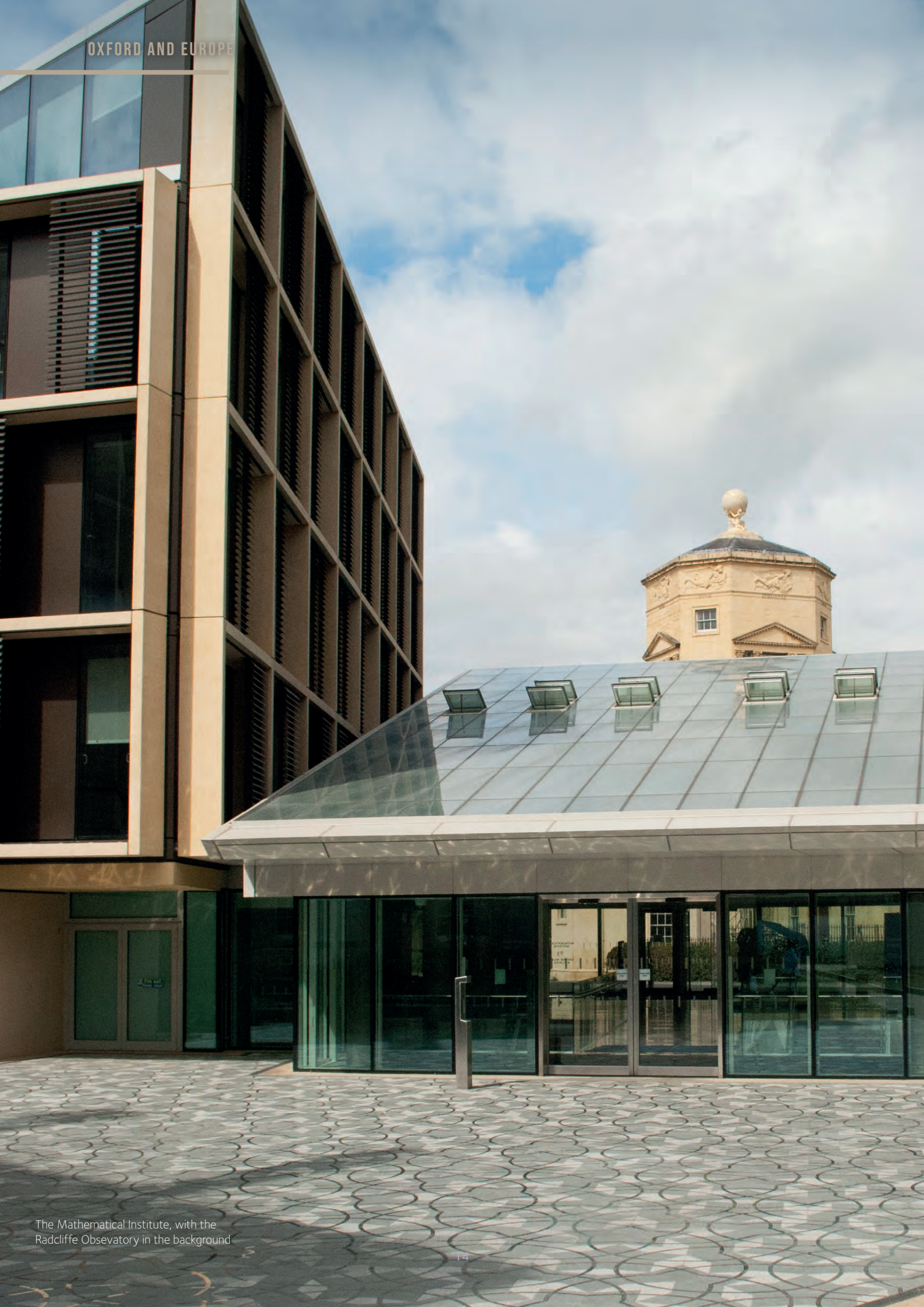
The Mathematical Institute, with the Radcliffe Observatory in the background