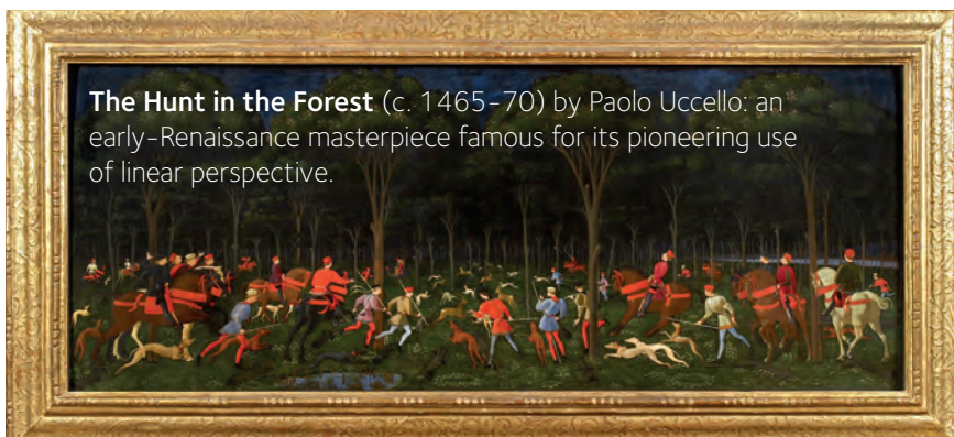
The Hunt in the Forest (c. 1465–70) by Paolo Uccello: an early-Renaissance masterpiece famous for its pioneering use of linear perspective.