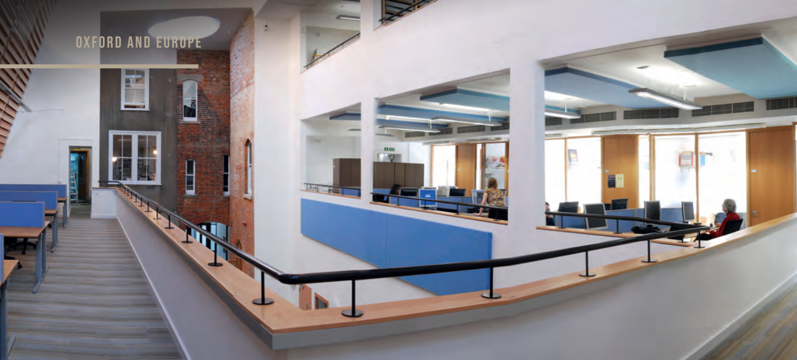
Above: The Ioannou Centre for Classical and Byzantine Studies