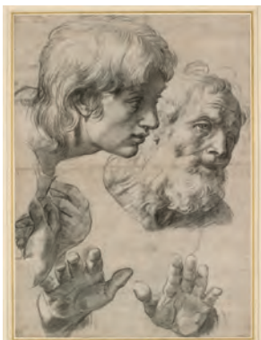
One of the world's greatest collections of drawings by the European Old Masters including works by Michelangelo, Raphael, Albrecht Durer, Francisco de Goya.

The University's other museums include the Pitt Rivers ethnographic collection. The Pitt Rivers Museum's object collection includes more than 80,000 artefacts from Europe and the British Isles. Highlights include the Museum's collection of several thousand European amulets and witchcraft-related objects including the iconic witch in a bottle. The rich archaeological collections include Palaeolithic, Neolithic and Bronze Age, Iron Age, Roman and medieval materials from Britain and Europe. Highlights of the European musical instrument collections include an Italian virginal made by Marcus Jadra in 1552 and early bagpipes including an 18th century musette de cour. The textile collections include some of the earliest Morris costumes in the UK. Others are embroidered textiles from Slovakia and the Czech Republic collected by Leonie Gombrich, the Irvine collection of 18th and 19th century British costume, and a collection of silverwork from the Balkans collected by Mary Edith Durham.