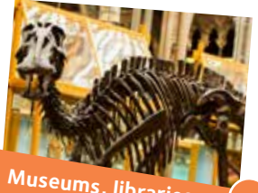
Museums, libraries and other places of interest