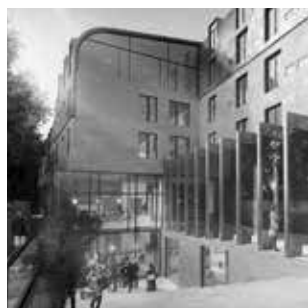
Visual impression of Cohen Quad

Exeter has many sports teams, a small gym and weights room on site, a sports ground and a boathouse on the Thames. Exonians, as Exeter College students are called, have had much sporting success, but most play for fun and exercise: it's not compulsory!