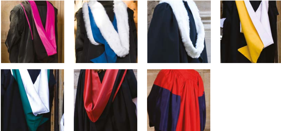
Top row: MTh graduate, BM BCh graduate, BA graduate, MFA graduate