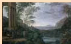
Claude Lorrain: The Enchanted Landscape