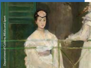
Department of Culture, Media and Sport