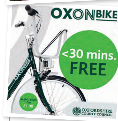
FROM TOP: TURNER'S TOWNSCAPE; DODO ON TOUR; JOIN THE BIKE SHARE SCHEME