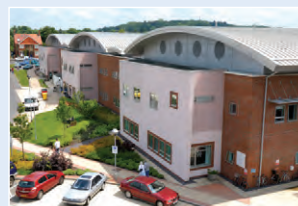
Nuffield Orthopaedic Centre