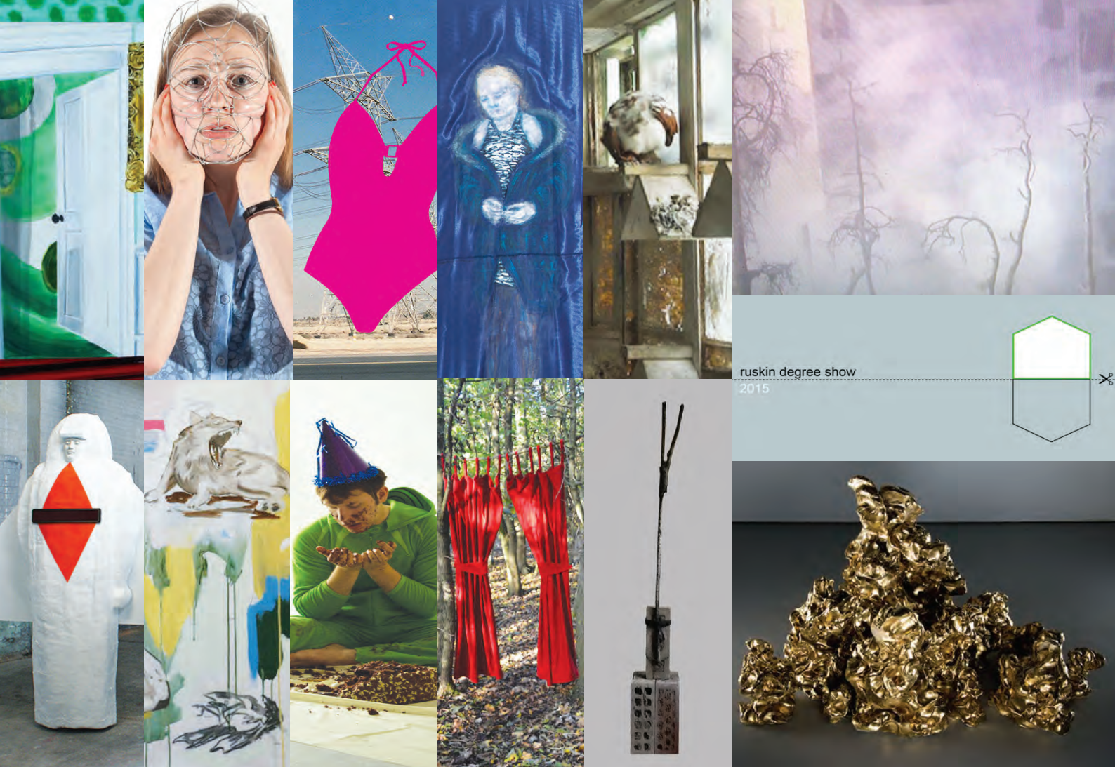
ruskin degree show 2015

who played a leading role in introducing the study of natural science into the University.