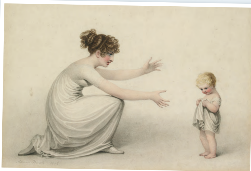
ABOVE: FIRST STEPS (1808) BY ADAM BUCK; BELOW: ALICE CONSIDERS HER OPTIONS

An information and training event for University and college staff who are involved with or interested in administrative activities. Registration opens 1 September.