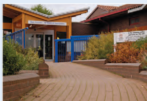
Horton General Hospital