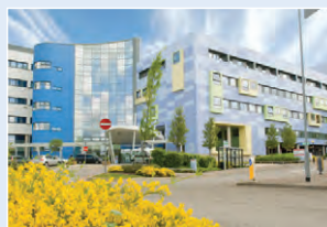
John Radcliffe Hospital