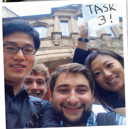
TOP: OVERSEAS STUDENTS OFTEN MAKE LIFELONG FRIENDS ON THE COURSE; BOTTOM: 'SCAVENGING' STUDENTS PHOTOGRAPH THEMSELVES IN OXFORD LOCATIONS THEY HAD BEEN GIVEN CLUES TO DISCOVER