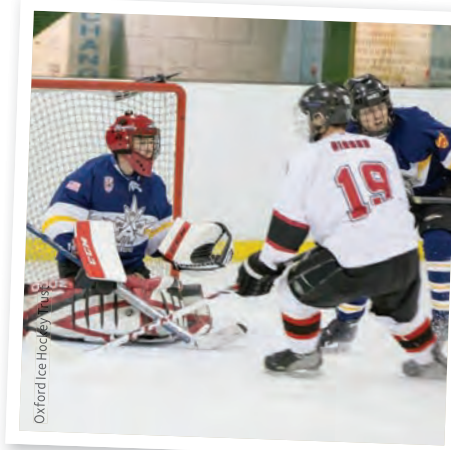
OXFORD'S ICE HOCKEY TEAM THIS YEAR INCLUDED TWO VISITING PROFESSORS

Members of staff are involved in almost all sports in Oxford, often training alongside students in the University sports teams. They take part in archery, tennis, table tennis, netball, triathlon, hockey and boxing – to name but a few on a long list. Unsurprisingly for such an international body of staff, some people also play ice hockey (see www.oxfordicehockey.com ), ultimate frisbee and American football. It is a wonder that anyone gets any work done.